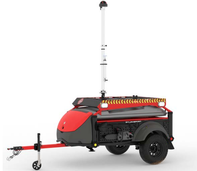
Raise mast before raising GO. Rapid Response