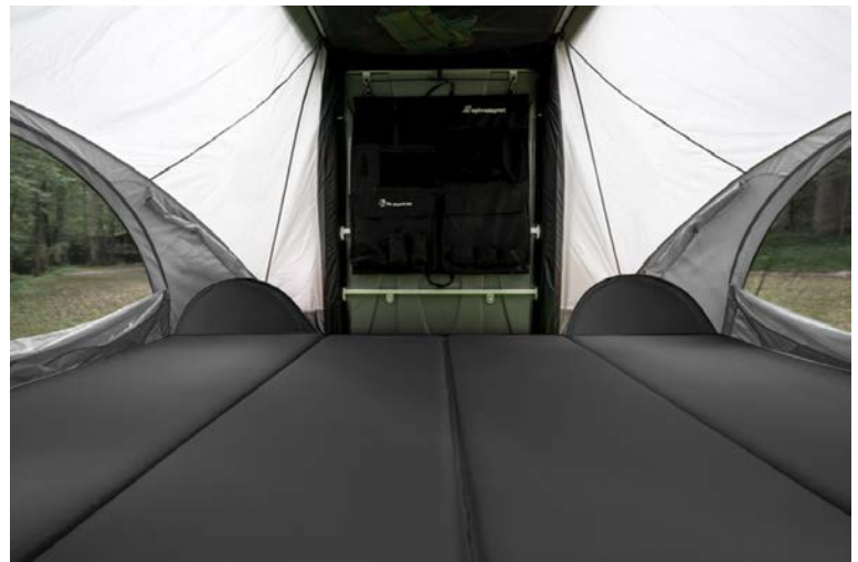
CONFIGURATION 4: ONE KING-AND-A-HALF-SIZED BED