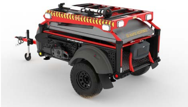
Travel with mast lowered and locked