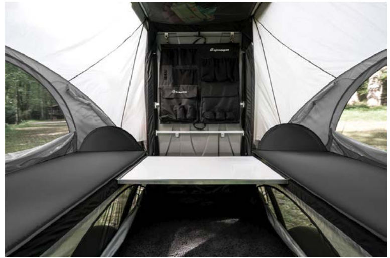
CONFIGURATION 2: TWO BEDS, TABLE, SHELF UNDER TABLE