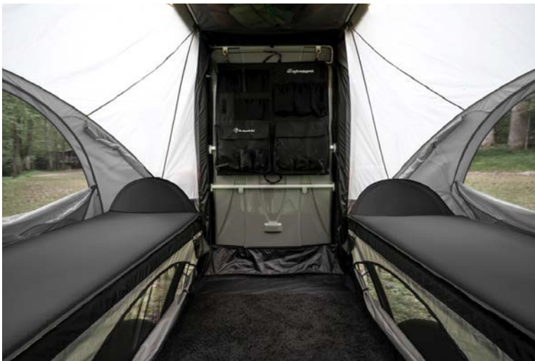
CONFIGURATION 1: TWO BEDS, OPEN FLOOR