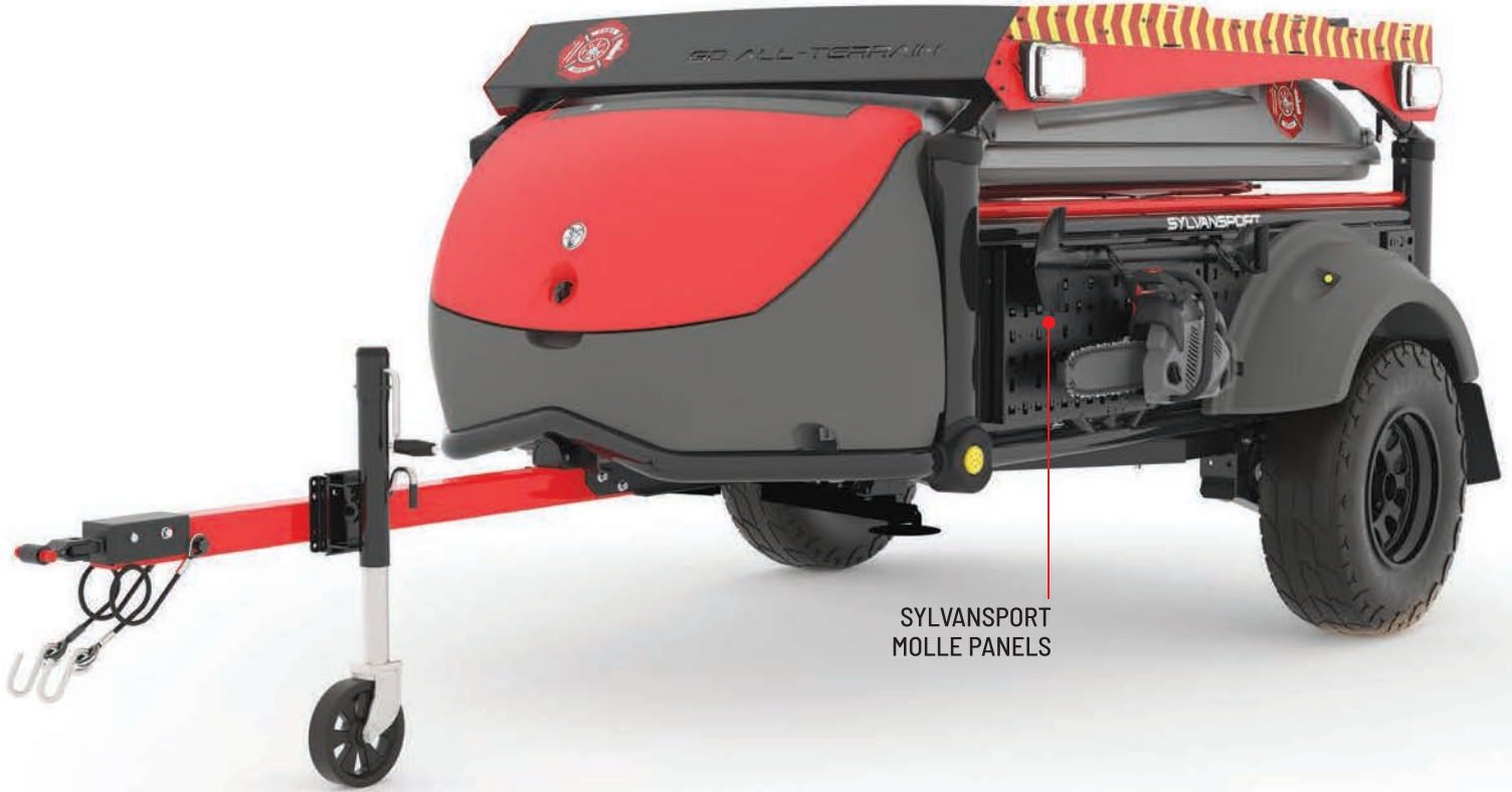
SYLVANSPORT MOLLE PANELS

GO. Rapid Response sides are designed to receive SylvanSport MOLLE (Modular Lightweight Load-Carrying Equipment) panels for side coverage on both sides. A standardized, flexible system of attachment allows users to securely fasten tools, equipment, pouches and other gear onto the GO. Rapid Response.