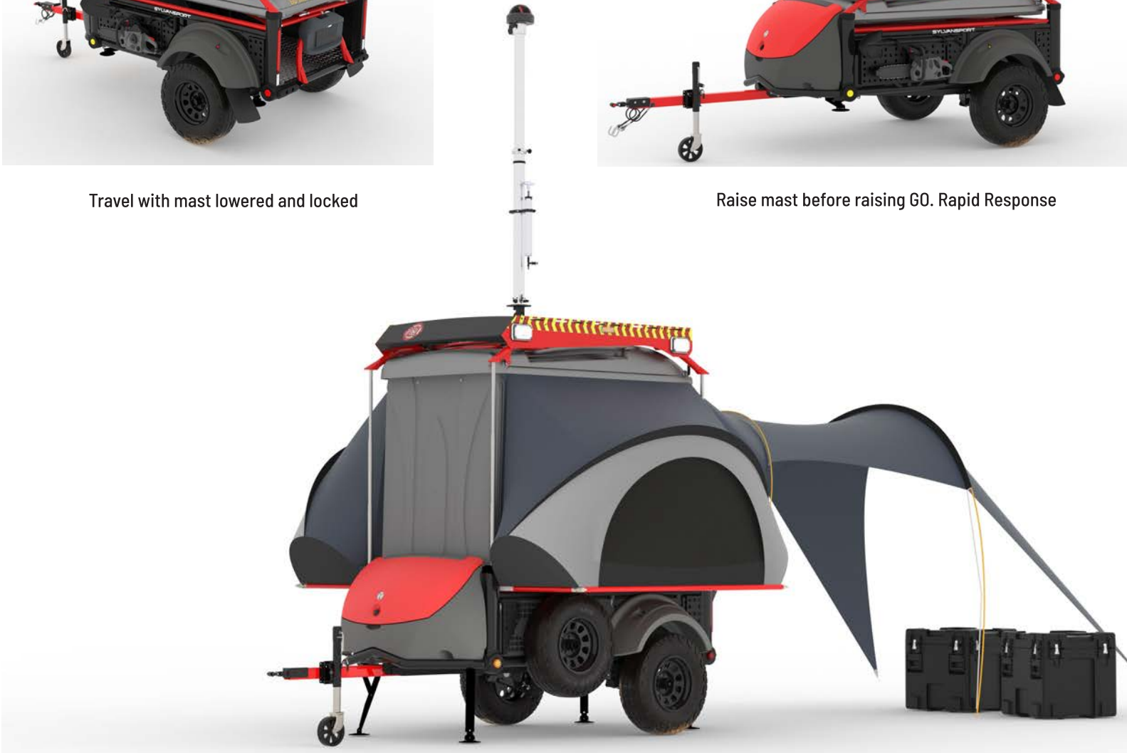
Raise GO. Rapid Response. Cameras, lights are 16'-20' above ground.