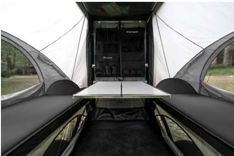
CONFIGURATION 3: TWO BEDS, TABLE FOR MEALS, MEETING, PLANNING